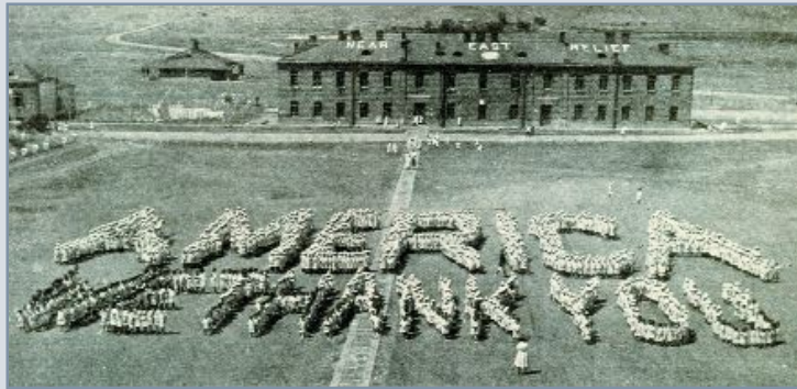
Twenty-five hundred in the Orphan City of 12,000 at Alexandropol express their thanks for American aid provided through Near East Relief. From The New Near East magazine, published monthly by Near East Relief from 1918 to 1927.

Like many friends of NEF, you are probably the kind of person who sees the tremendous need in the world and seeks to make a positive impact. And probably you have learned from experience that many people working together can make a bigger difference.